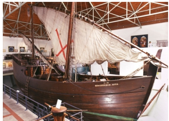
Picture 1 Bartolomeu Dias Caravel at Bartolomeu Dias Museum Complex.

Government, n.d.). Although Mossel Bay is not one of them, this area also has quite many historical sites. Similar to the Denpasar, Mossel Bay has also developed the same concept in attracting foreign and domestic tourists. Mossel Bay has several tourist attractions leaning more towards historical sites where some of the places that have become quite famous destinations such as the Bartolomeu Dias Complex Museum. The historical traces Bartolomeu Dias left behind can be seen in this museum, including the replica of the caravel that he used to explore the seas and the historic post office tree (Fleminger, 2020).